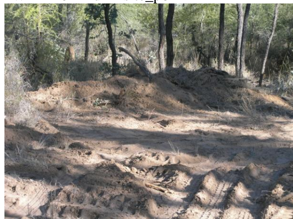
WAR 34-05 drill site_p3