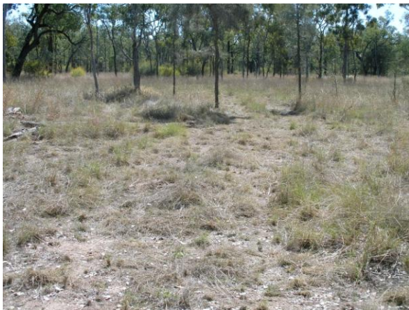
WAR 40-11 drill site_p3

Whilst minimal disturbance occurred at some sites, most suffered from excessive disturbance of ground cover vegetation. This ranged from unnecessary and excessive driving of machinery over intact ground vegetation rather than using identified tracks (eg photos entitled WAR 40-11 drill site_p3; WAR 40-11 drill site_p6) to the complete removal of the groundcover vegetation across entire sites with topsoil piled up all around the drill site area (eg photos WAR 34-05 drill site_p1; WAR 34-05 drill site_p3).