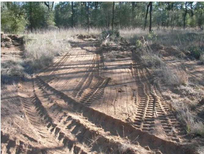
WAR 34-05 access track_p5