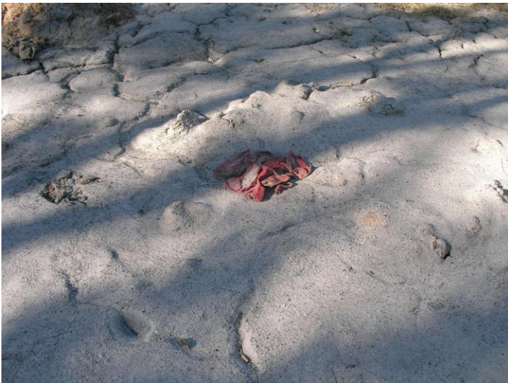
WAR 36-07 drill site_p4