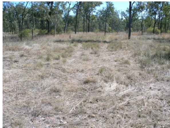
WAR 40-11 drill site_p6