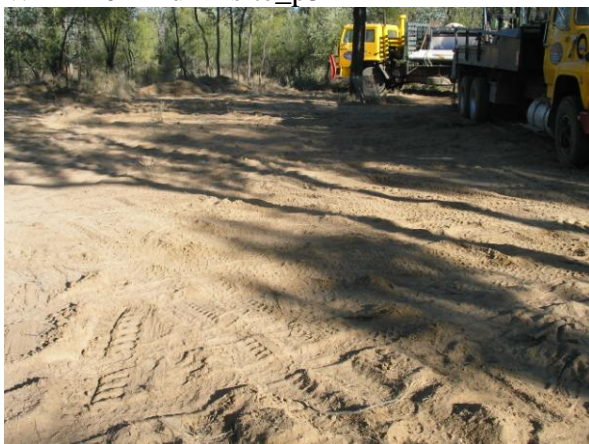
WAR 34-05 drill site_p1