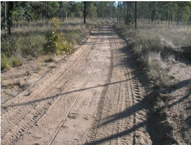
WAR 34-05 Corella track_p4;

In addition, topsoil removed during this track construction was simply left in piles besides the tracks, with more blade-clearing occurring during this ‘piling’ process (eg photo WAR 34-05 access track_p5). The future erosion damage from such complete removal of ground cover on these blade-cleared tracks, particularly on the slopes, is likely to be significant. It will also assist the spread of environmental weeds through ease of seed movement.