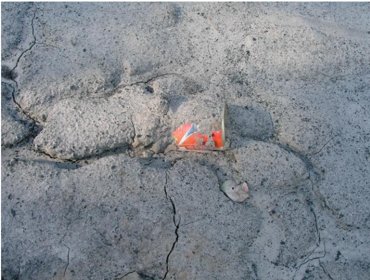
WAR 36-07 drill site_p2