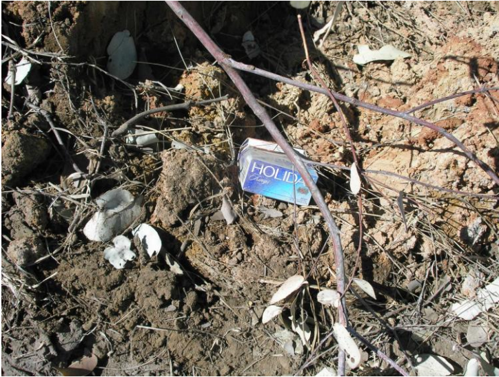
WAR 34-11 drill site_p4